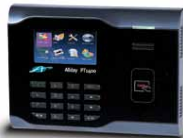
Allday Time Systems PT1400

Suitable for all types of small business of up to 50 employees.