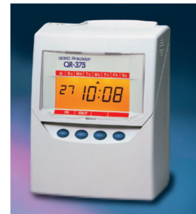
Specifications: Height 20.5cm (8") Width 16cm (6.3") Depth 12.8cm (5") Weight 1.5kg (3.3lbs) Power 220-240v AC 50/60Hz

Allday Time Systems are also able to supply a full range of accessories, software and consumables.